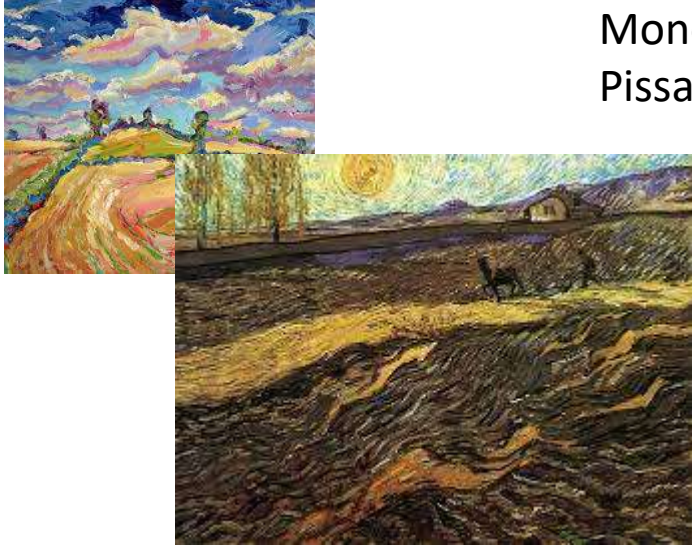
Year 2 Sunrise over fields Monet, Pissarro