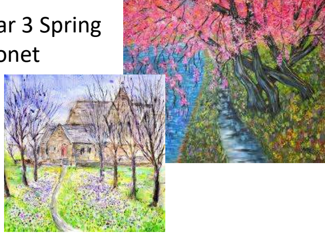
Year 3 Spring Monet