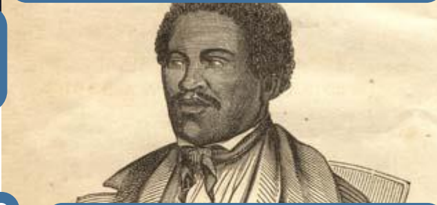
Henry Box Brown