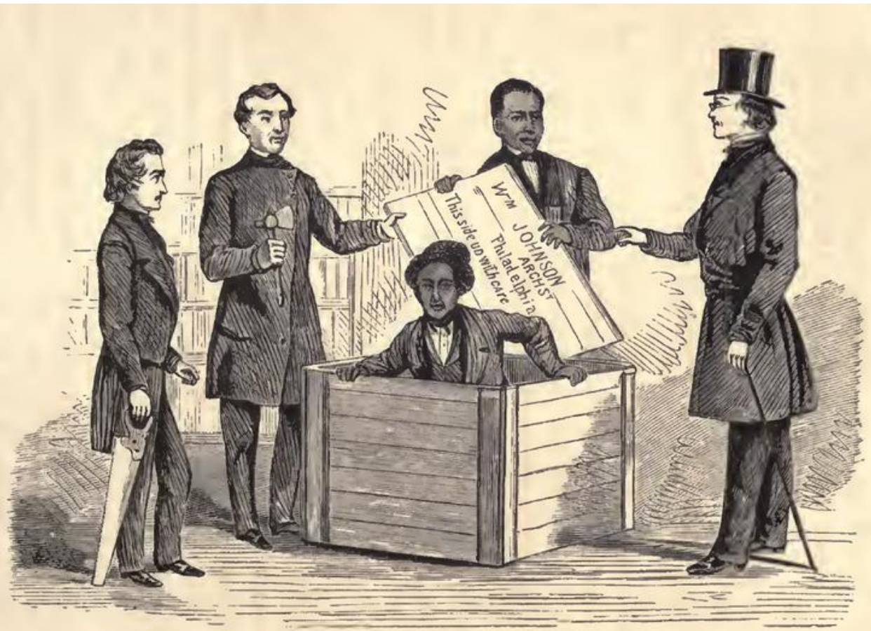
RESURRECTION OF HENRY BOX BROWN.

Henry Box Brown was born into slavery in the United States but after hiding in a box he managed to escape and get to England. He lived in England for 25 years, touring the country as a magician and teaching people about the anti-slavery movement.